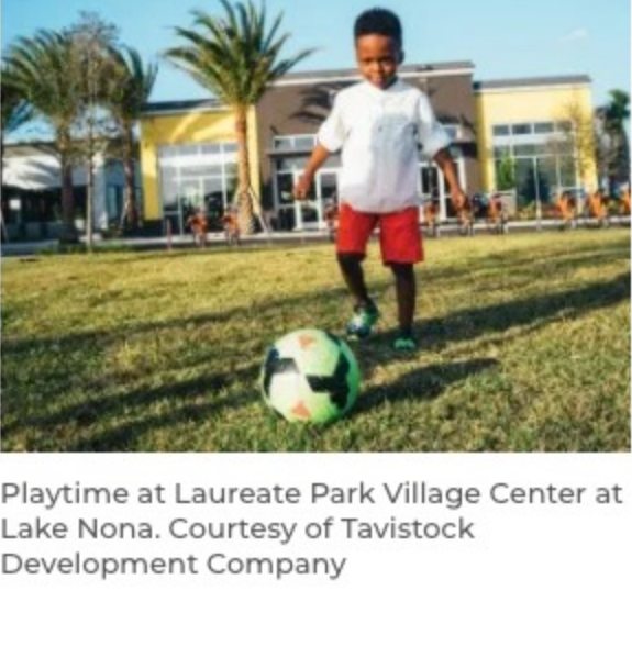
Playtime at Laureate Park Village Center at Lake Nona.